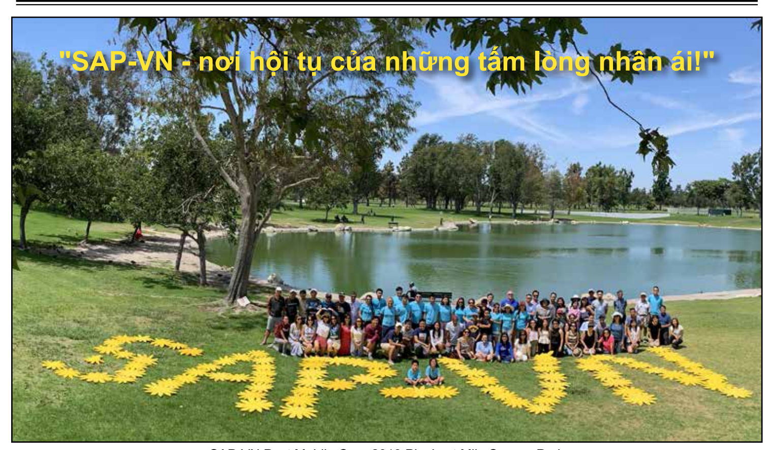
SAP-VN Post Mobile Care 2019 Picnic at Mile Square Park

NONPROFIT U.S. POSTAGE PAID Santa Ana, CA Permit #1275