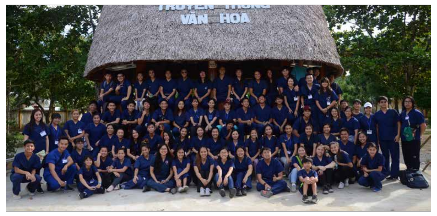
SAP-VN Youth Volunteers at Mobile Care 2019

Personally, I learned a lot from being a member in SAP-VN and specifically participating in the Mission Trip. I learned from the SAP-VN adults' compassion. Even though they were all busy with their life in the US, they still sacrificed their personal money, and time to help the less fortunate. I admire this very much and they are my role models in the future. The trip also helped me to realize how much love and happiness could be spread through simple sign languages such as a hug or a "hello". Nothing could compare to the look on the people's eyes for us, they were grateful, and the smile on the kids as saying "thank you" in their language.